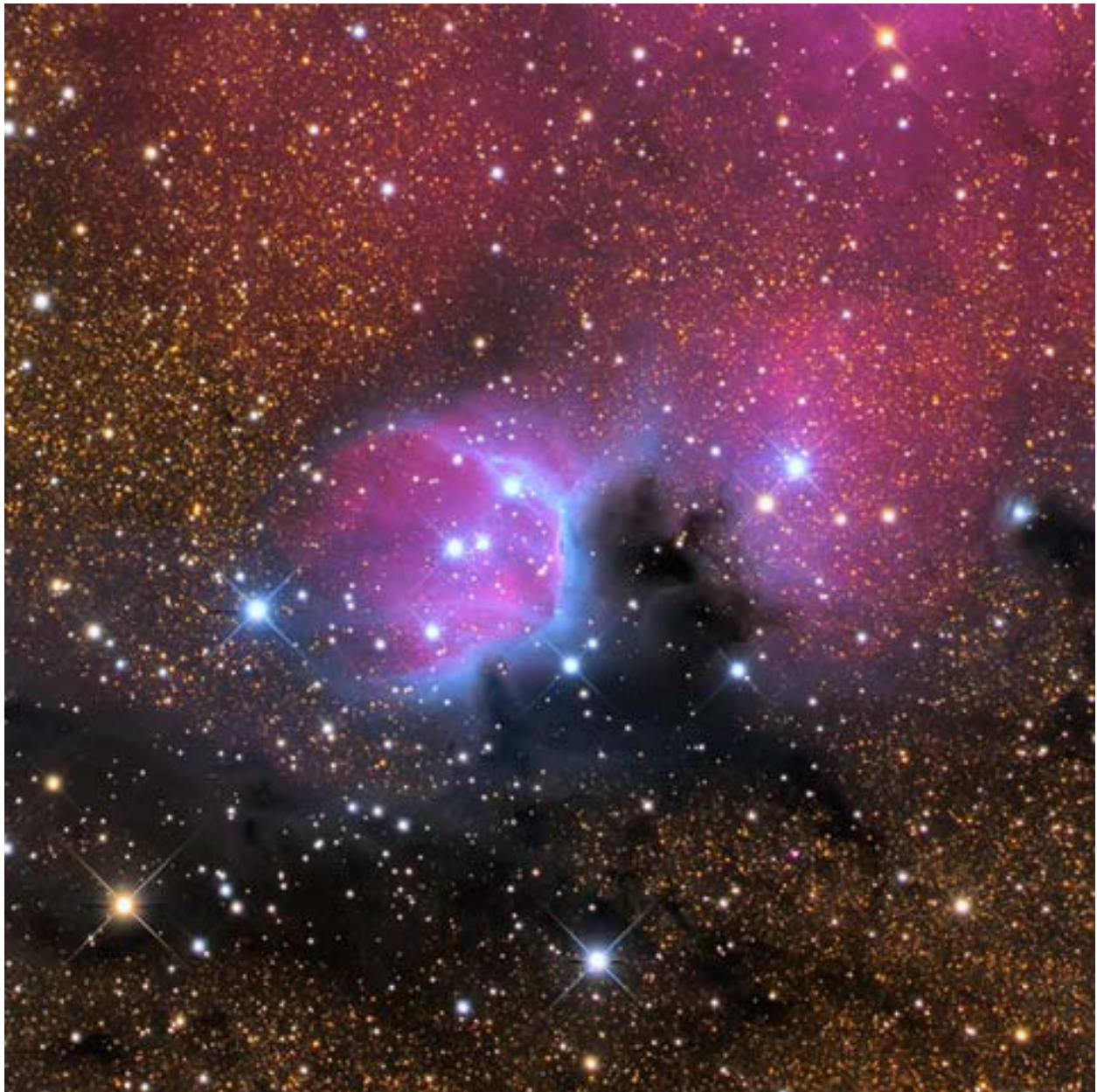
Figure 7 - IC1275

Let's finish with a couple more images made by Wolfgang Promper using FLI cameras and filters. The first is IC1275, an emission nebula in Sagittarius. Using a ProLine PL4240 and Finger Lake research grade RGB filters required only 130 minutes of total exposure (40', 40', 50' respectively) using 5' sub-exposures.