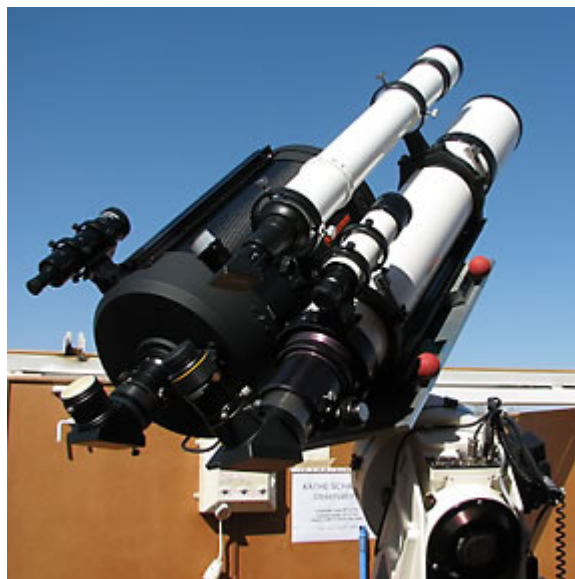
Figure 1 - Celestron C11 carbon fiber tube and an AstroPhysics Starfire 127 on an AP GTO 1200 mount

The observatories have a wide array of available high end telescopes on jealousy inducing mounts. A small sample of the equipment available for visitors' use follows: