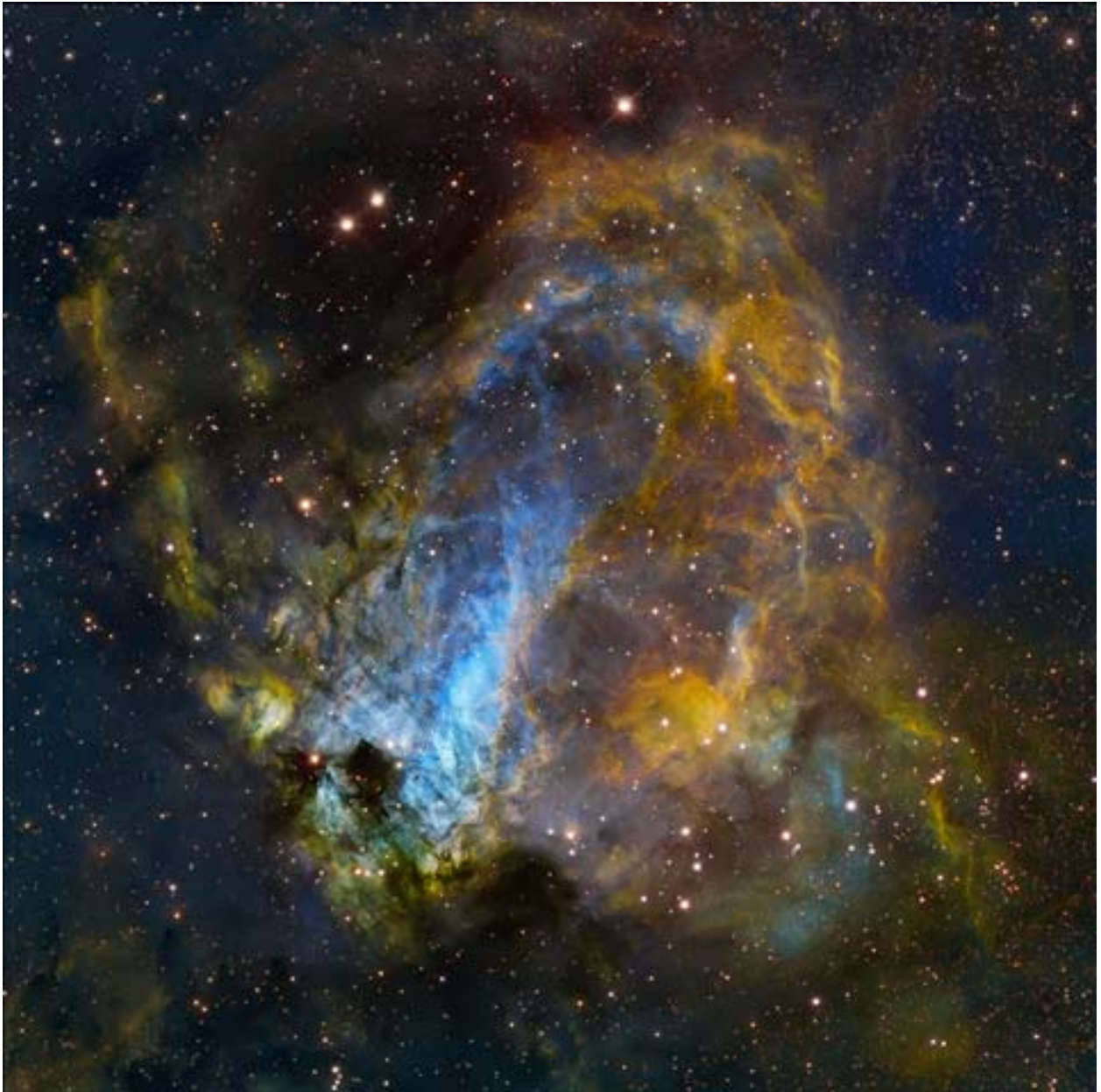
Figure 6- M17

This was made using a ProLine PL3041 camera and Finger Lake Instruments research grade filters. It is M17 and required only 50 minutes each of SII, Ha and OIII data in 10 minute increments! I've made several attempts at this object from dark skies (such as they are from Massachusetts) and can honestly say that there is no way I could have made this image with anything even close the amount of time Wolfgang Promper needed to make this image.