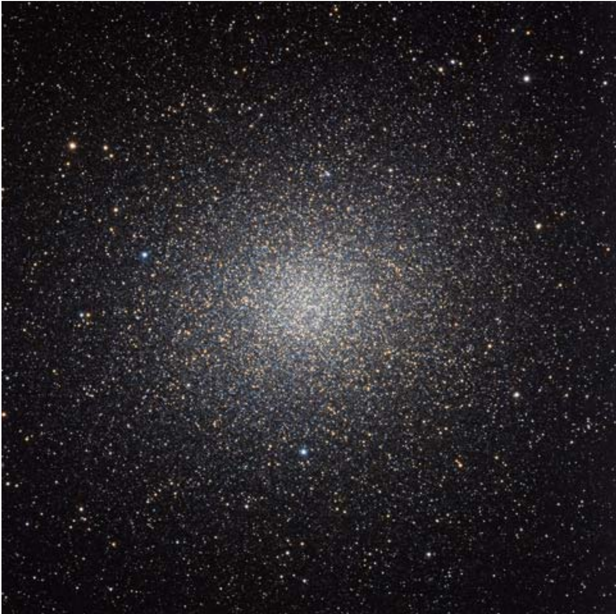
Figure 8 - NGC5139

You can learn more about the AstroFarm at http://www.tivoli-astrofarm.de/e_tivoli_astrofarm.htm . There you'll find more information about the history of the farm, travel requirements, available equipment and the best times to travel (think Winter in Namibia).